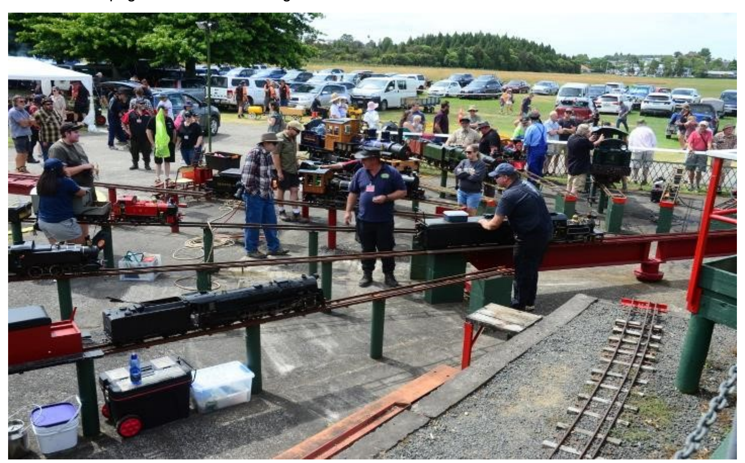
The steaming busy bays at the Hamilton Model engineering Club's Minogue Park Miniature Railway.