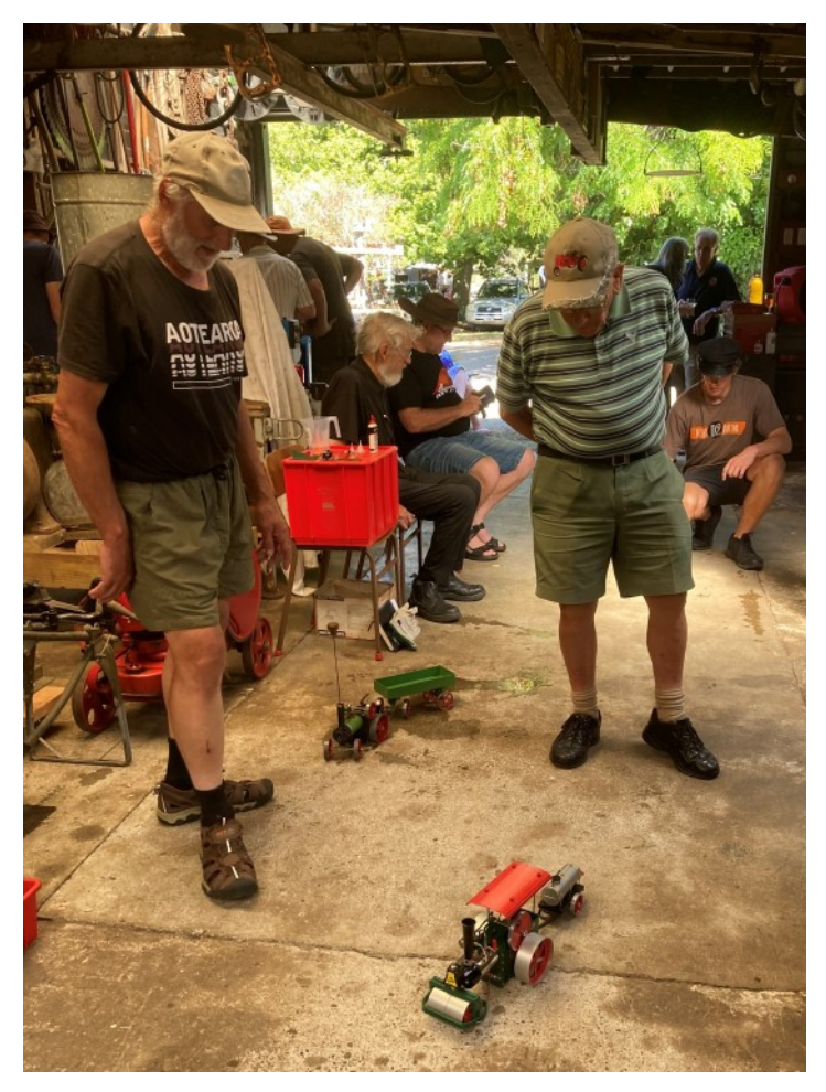
A couple of young feller's avoiding being squashed flat by an Wilesco Old Smokey steam roller.