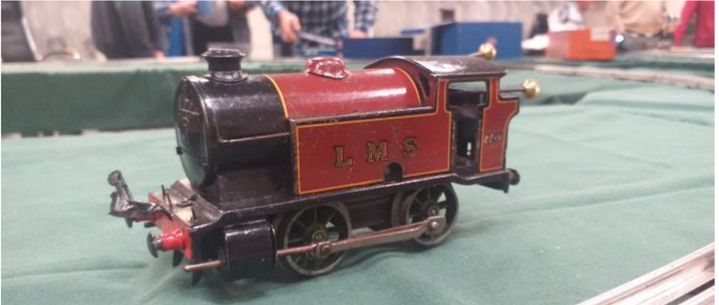
A little tank loco, dating from the 1940's, a model 101 in LMS livery now in the care of the Mudgway family. Photo Editor