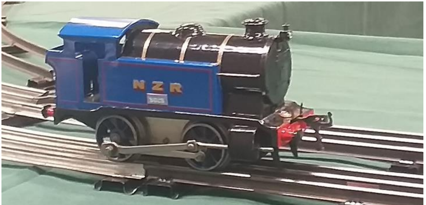
Another model 101 tank loco ex clockwork rebuilt from a well abused non running example by the fitting of an electric motor and a repaint of the livery to a NZR Tank loco by Bruce. Photo Editor Below. The Taupo Totara timber Company's Alco Mallet modelled in 0 gauge also by Bruce. Photo B Geange