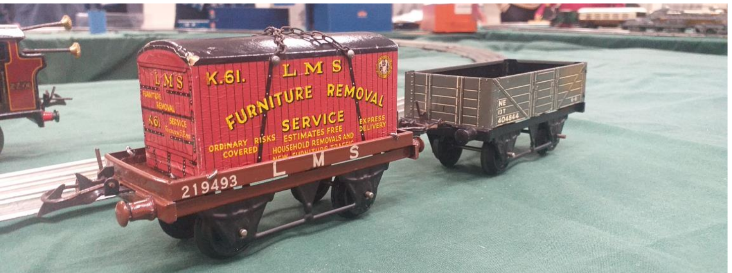
Four wheel rolling stock dating from the 1950's