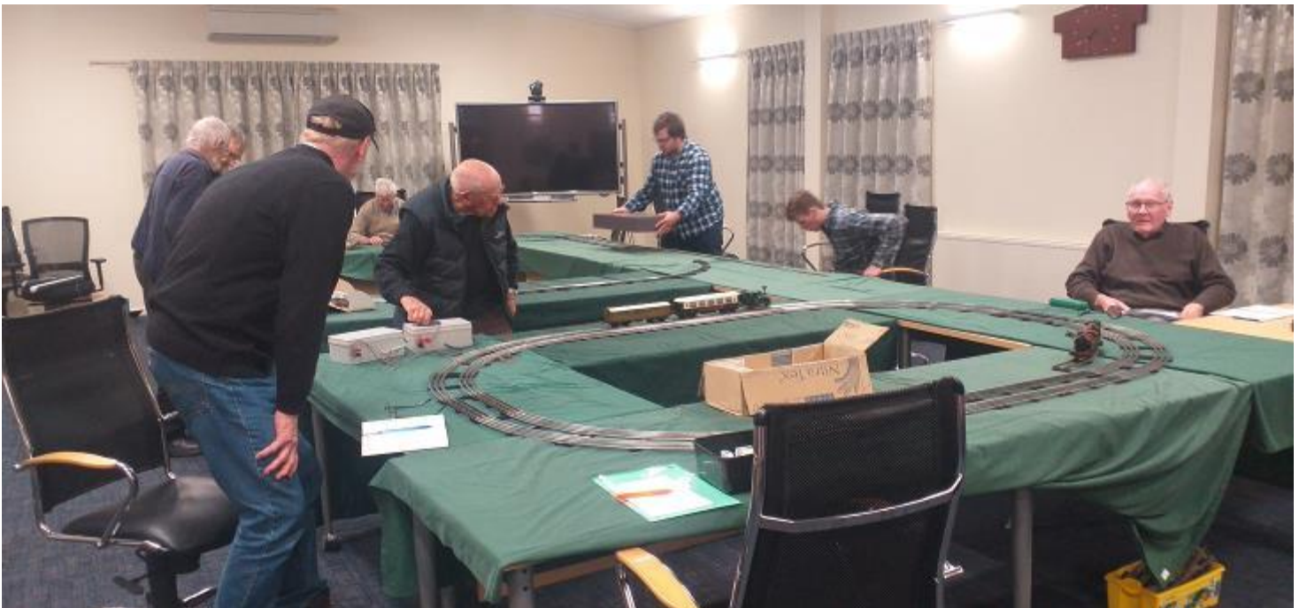
0 gauge rail being set up at the close of AGM business, Hence the need for many tables!

Other club members have a few items of Franks production also and these were brought along to ride the rails on this occasion