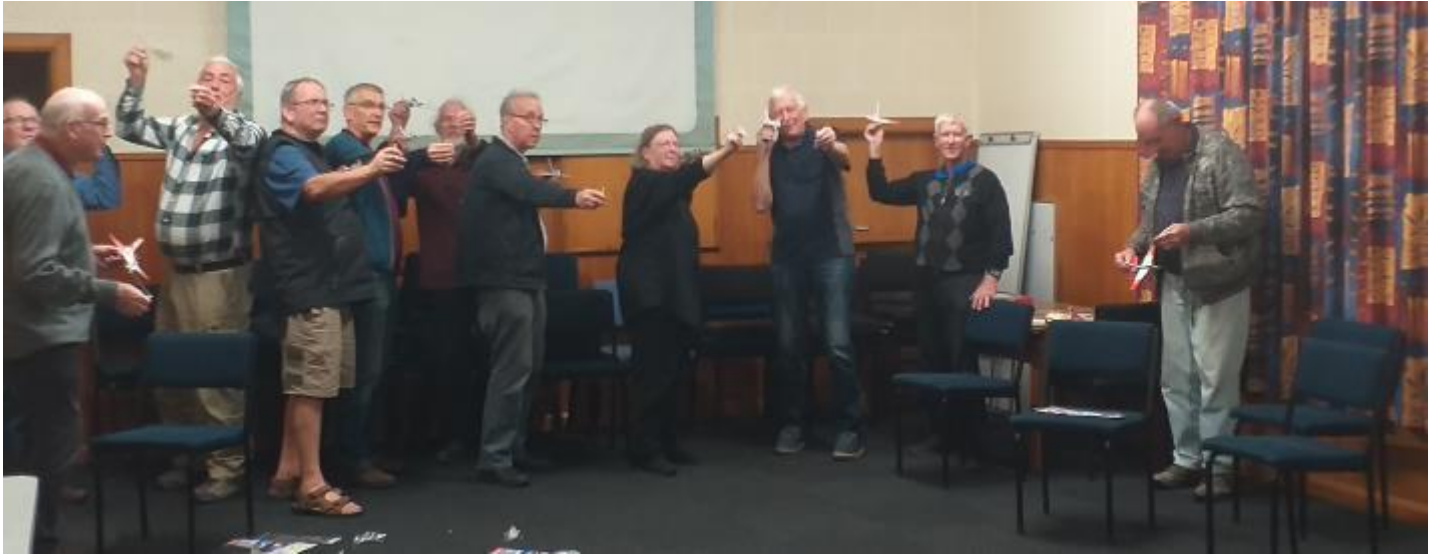
Club members patiently awaiting their turn to launch! Not.

Being short of space in the Hearing Association Hall the kits came complete with a catapult launch system similar to what is used on aircraft carriers for a quick take off ie a piece of rubber band and this is were the assessment of your flying skills began with test flying of the aircraft to fine tune the trim to produce suitable flight characteristics for the challenge that lay ahead! The entrance end of the hall has the prevision for a projector of some sort to be recessed into the wall, a slot approximately 400 mmx 200 mm and whoever was able to land their jet into that slot would earn their wings or have them clipped on how easily it was to do.