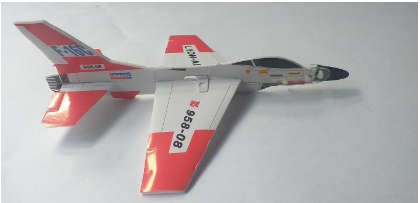
General Dynamic's F16C Fighting Falcon battle scared from too many crash landings.