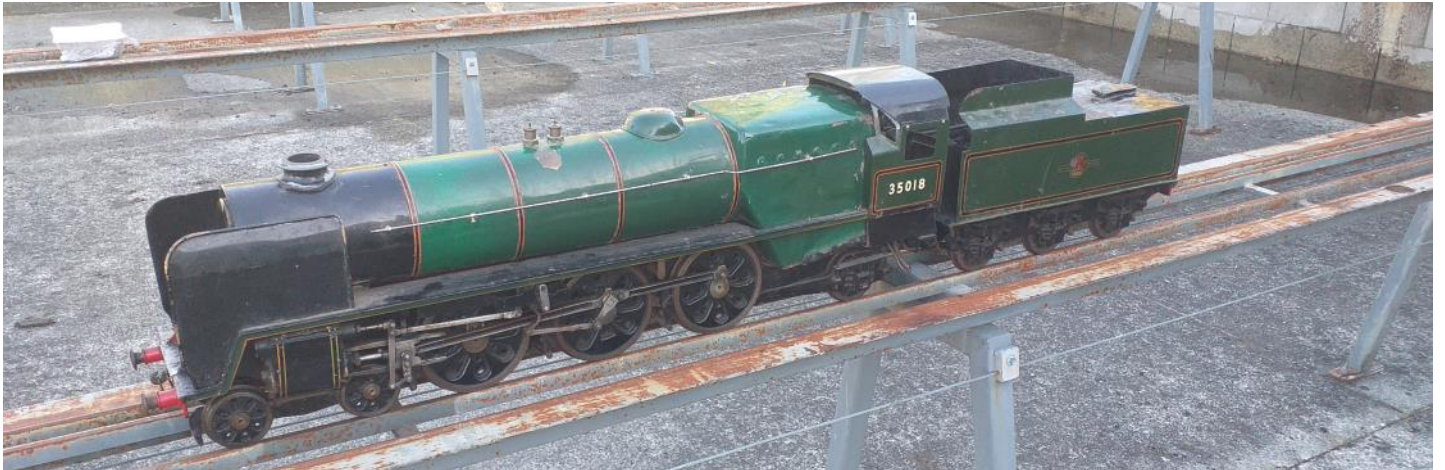
Rebuilt Merchant Navy class 4-6-2 35018