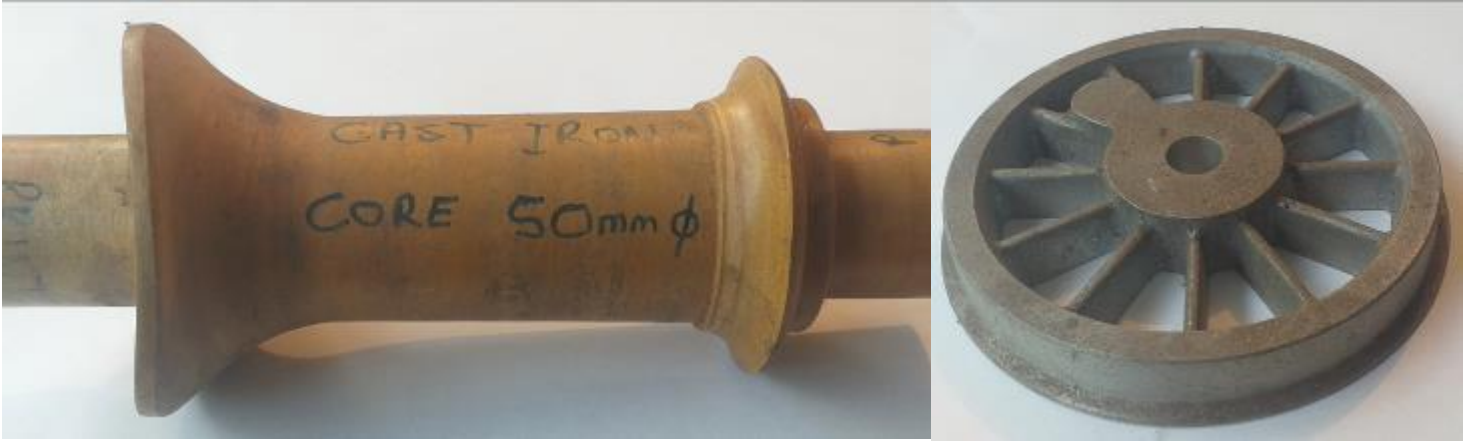
Pattern for a NZR steam locomotive chimney (W192) (S216) and cast iron wheel (W192)

If you have items that require a Cast Iron casting to be produced here is an opportunity for you to do it yourself under expert guidance and tuition. You just have to produce the required patterns for your project or borrow someone else's if you know they exist.