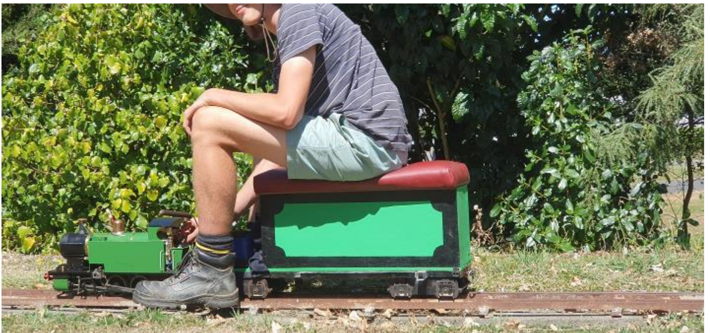
Newly refurbished Juliet having a run at the Mariner Reserve Railway.