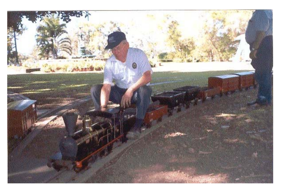
A Queensland Railways "A10" with freight.

I could not understand why it was such an early start to the day, but soon found out why. It is not like our club where all that has to be done prior to running is to lift the point covers and caps over the control switches. Everything had to be set up. Fencing was put in place, point blades had to be bolted in, shade had to be put up, so I was very busy helping do all this and the time went very fast.