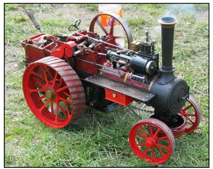
Richard Lockett's 1 1/2" scale Allchin