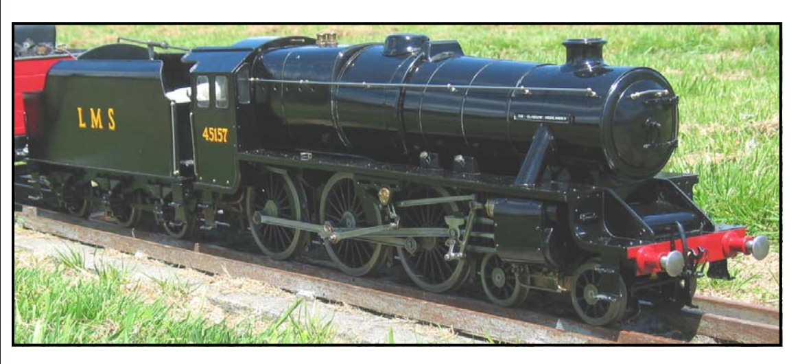
Bruce Geange's Black Five