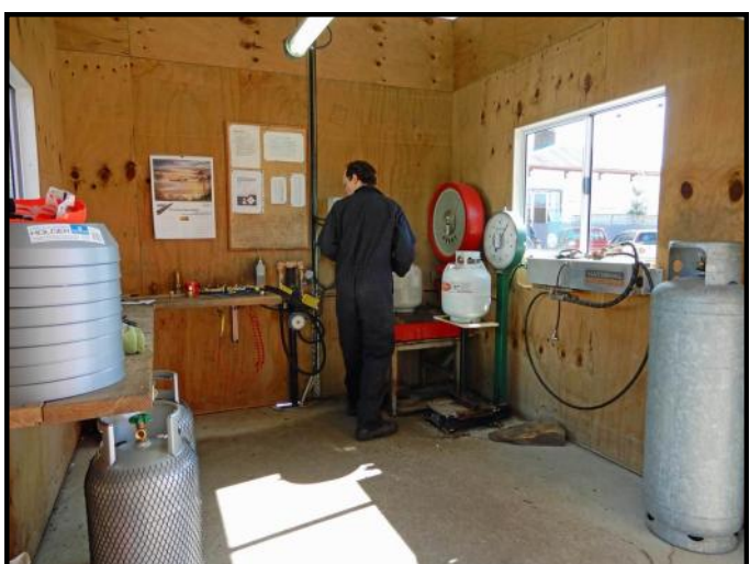
National Gas Ltd in Bourke St PN.